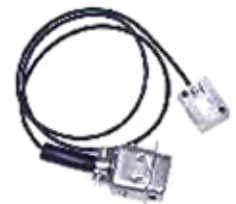
LOW FREQUENCY ACCELEROMETER

Other sources of audible noise may come from various mechanical imperfections (binding bearing or bushing, loose mounts) in the fan motor assembly. Additionally, variations of the DC motor commutator brush bars (out of round, incorrect height, etc.) could result in not only a poor electrical performance (radio interference) but also in indirect audible noise caused by abnormalities in the motor torque (low frequency “hunting” variations of the Ampere waveform).