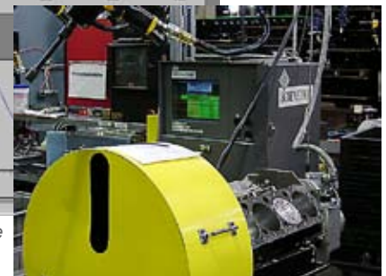
Side View of station showing Engine Block in foreground and Sciometric Test and Analysis System in background.