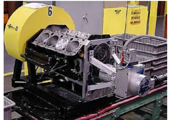
V8 Engine Block Test Station with metal test fixture mounted on front

A handheld Atlas-Copco® Nut Runner torque wrench tool was manually attached to the crank and used to turn the crankshaft for brief periods at a constant velocity. A separate encoder and torque sensor were used to measure breakaway and running torque against angle while air back pressure is also measured in the oil gallery as pressurized air is forced into the block. The supply line (with the supply pressure sensor inline) and back pressure sensors were attached to the engine with quick disconnect couplings, and a hole in the engine oil gallery was plugged to prevent leakage. The software button "Run Test" is pressed, and the operator is prompted to enter a serial number. Once the serial number has been entered, the Sciometric Test and Analysis System remotely starts the Atlas-Copco® tool using a solid state relay (SSR) output.