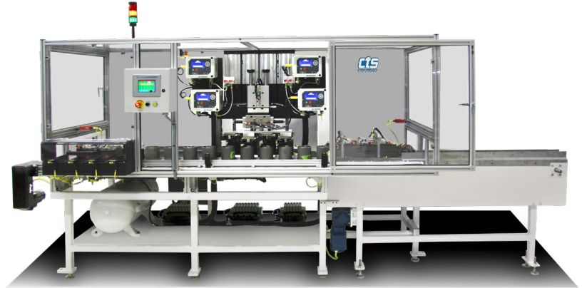
Custom CTS 4-station C28 turnkey test system