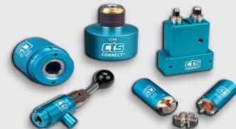
CTS Connect® Connectors and Seals