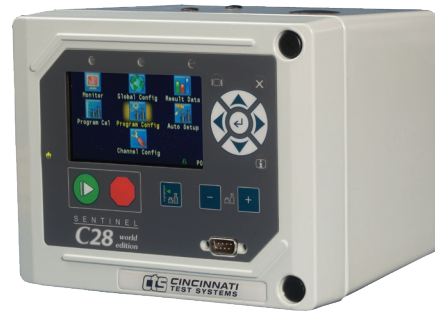
Sentinel C28 leak test instrument