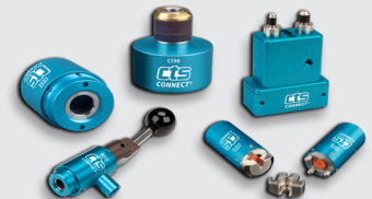
CTS Connect® Connectors and Seals