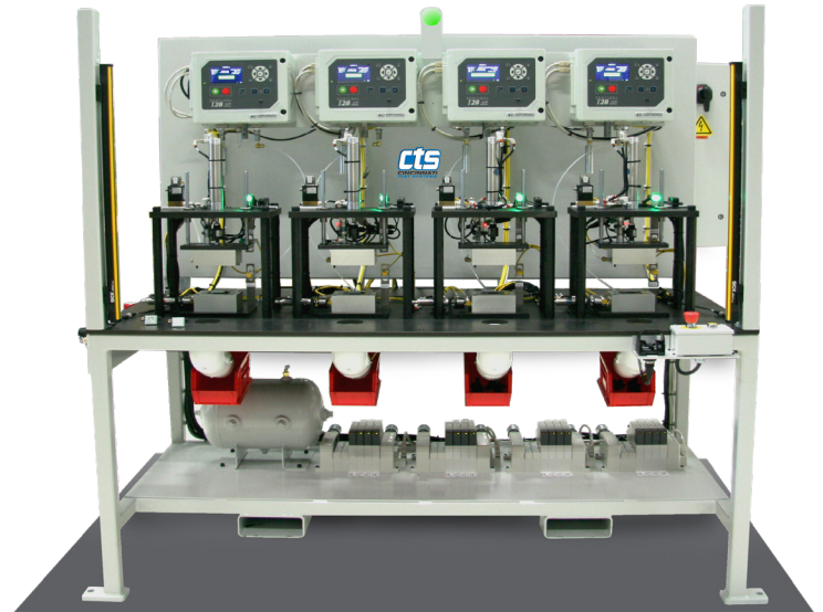
Custom independent CTS 4-station I28 turnkey test system