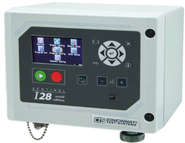
Sentinel I28 leak and flow test instrument